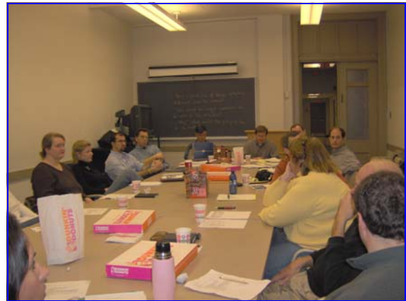
Fueled by Dunkin’ Donuts, SARA Board Members Discuss the Issues at Annual Meeting