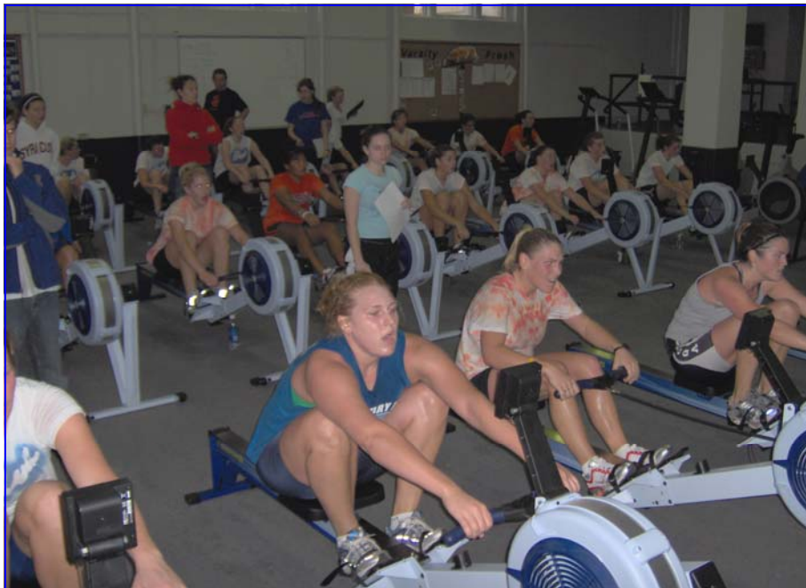
SU Women Battle the Ergometers in Saturday Morning Practice