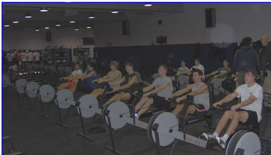
SU Men Practice in the Compson Room. "Friends Don't Let Friends Erg Alone"