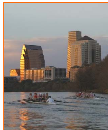
On the Water in Austin

Sanford has been making some changes to keep it fresh and interesting for the squad. Instead of the usual Winter Break trip to Florida, the Orange Women went to Austin, Texas. "We were looking for a change," she told The Orange Oar . "It turned out wonderful. The weather was great, the accommodations and location of the hotel and boathouse were perfect and the waterway was very rowable all the time. We will definitely go back next January."