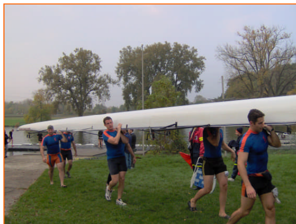
'99 Crew takes it to the (boat) house