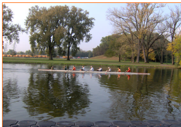
Alumni Eight in a Recreational Row