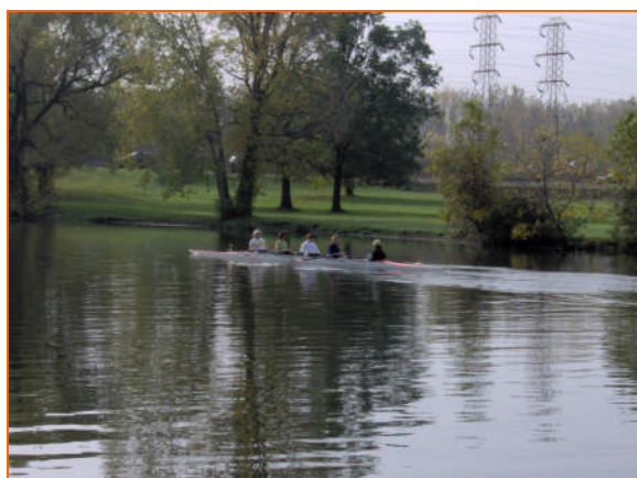
Alumnae Four Powers Down the River