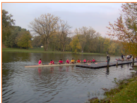
Winning '98 Crew/Wedding Party Lands