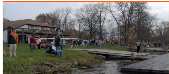
Boathouse Bustles at Syracuse Invitational