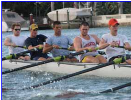
Windy Workout in South Florida