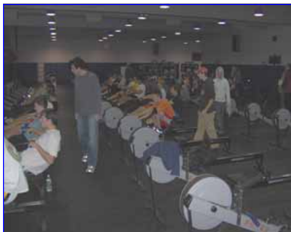
Coaches and Coxes urge SU Men on