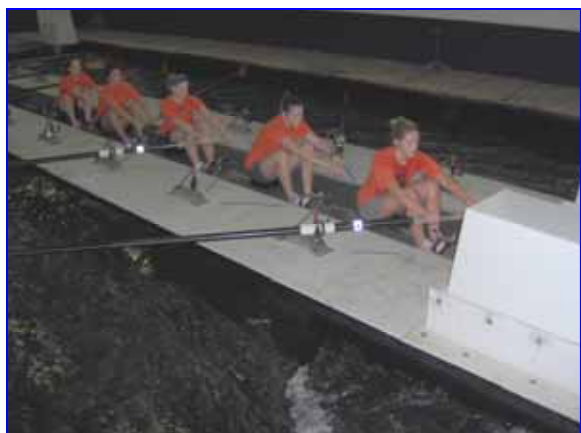
SU Women at work in the tanks

“We’re moving in the right direction. It’s never as fast as you want to go but I think our depth and speed will start to show up this year and even more so next year.”