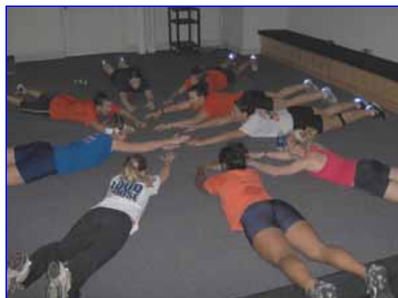
Stretching it out together