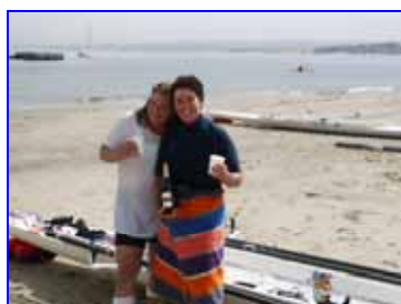
Champagne for the victors