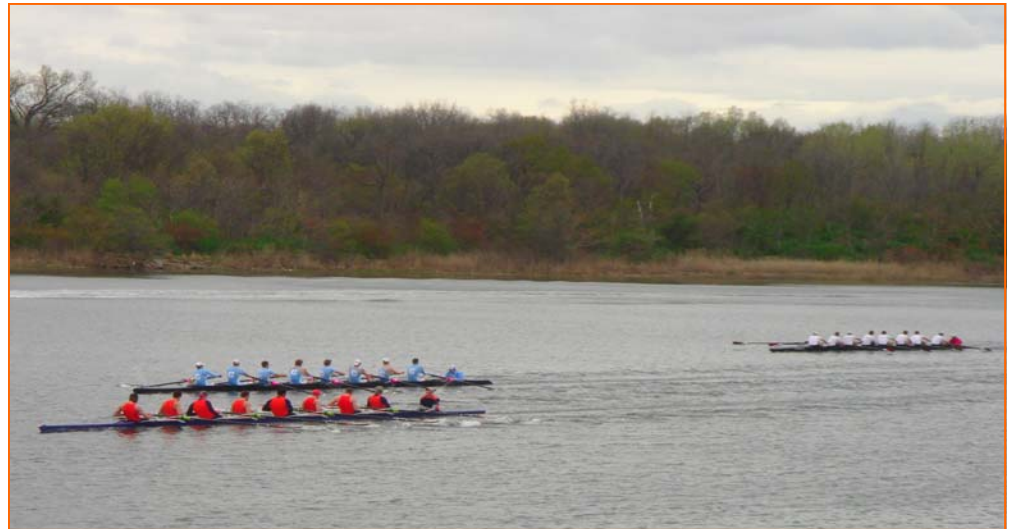
Men's Varsity Eight holds off Columbia with Boston University in the distance.