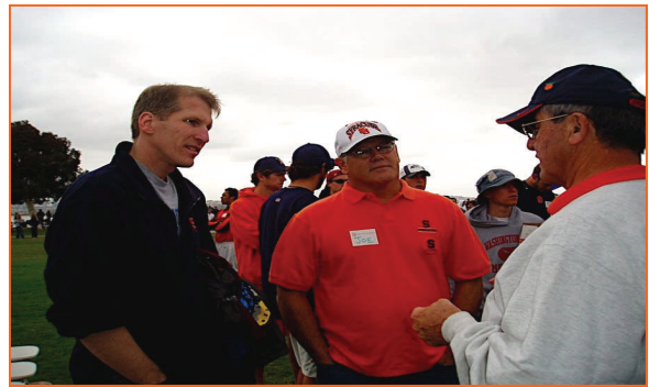
Supporting SU in SD