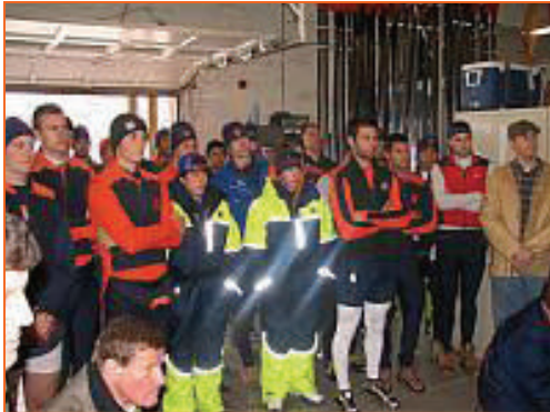
Men's Team, Alums and others listen...