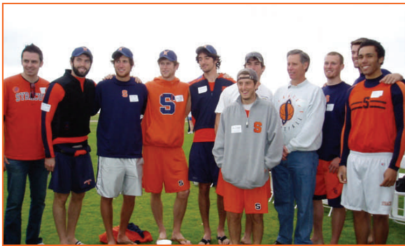
Varsity Eight Takes a Shore Break

Washington won the Copley Cup over Princeton, which had just qualified for the Grand Final, with Harvard third.