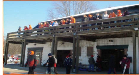
Orange Cheer from Boathouse Balcony