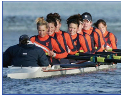
SU Varsity Versus Opponents, Elements