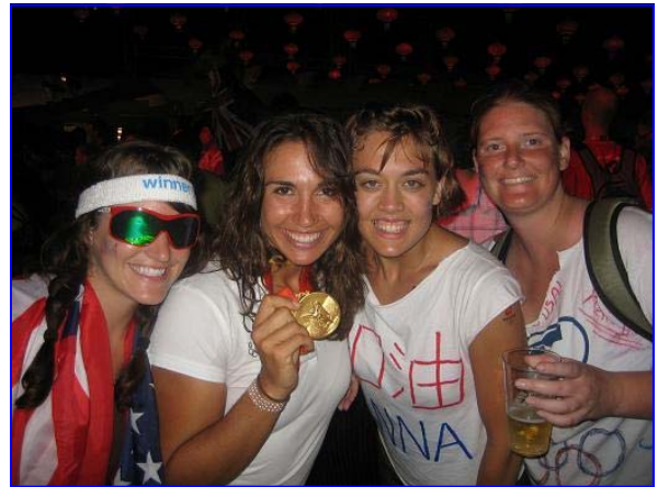
Anna and her “groupies” - Gold for Goodale

The Orange women spent the rest of the day as “Anna’s groupies” and found out what it’s like to be part of a champion’s group at the Olympics. “Do you know what it means to be best friends with an Olympic Gold Medalist? It means that it takes you at least two hours or more to walk about ten feet. EVERY-ONE wanted pictures with Anna. She’s very media friendly. We also had a reporter from Sports Illustrated following us around which was pretty cool.”