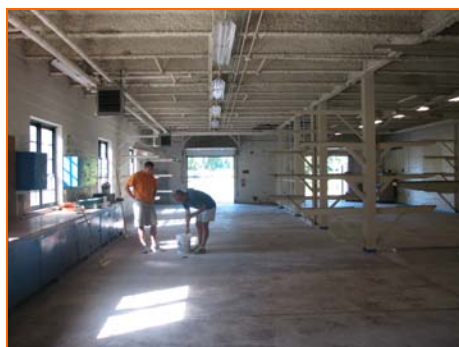
Coaches Grinding Away

They say it's all about facilities (whoever "they" are) and while discussion brews about a new boathouse for SU's women and men's teams, the current building has been given a bit of a spiffing up this fall. Onondaga County came through with an exterior paint job